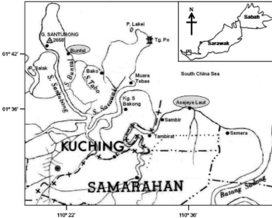
Figure 1. Location of the study sites (highlight in grey colour) Asajaya Laut (N 01° 36' E 110° 36') and Buntal (N 01° 42' E 110° 22').

analysed. Total shell length and total wet weight were measured using analogue vernier caliper and digital balance (Setra EL-410S) to the nearest 0.001 cm and 0.001 g, respectively. Gonad was noted for colouration and appearance and removed carefully from the flesh, starting from the digestive gland until the interior foot and weighed. Sexually-undifferentiated individual terms were used to refer to individual where the sexes could not be distinguished due to lack of gonad content. Microscopic observation was done to clarify the sexes using compound microscope (Leica) at 100× and 200× magnification in order to observe the sperm and eggs. The weight of shells dried at 60°C for 3 hours were recorded. All measurements were done in triplicate on the same specimen. GCI was obtained by the formula = Fresh Weight of Gonad Tissue / Shell Dry Weight (Darriba et al. , 2004).